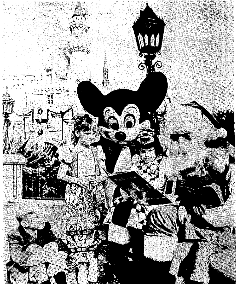
Mickey Mouse and Old Saint Nick take time from a busy holiday schedule to read a fairy tale to young Disneyland guests in the forecourt of Sleeping Beauty Castle.

Dec. 18 through Dec. 23, from 9 a.m. to 6 p.m. Dec. 24, and from 10 a.m. until 7 p.m. on Christmas Day.