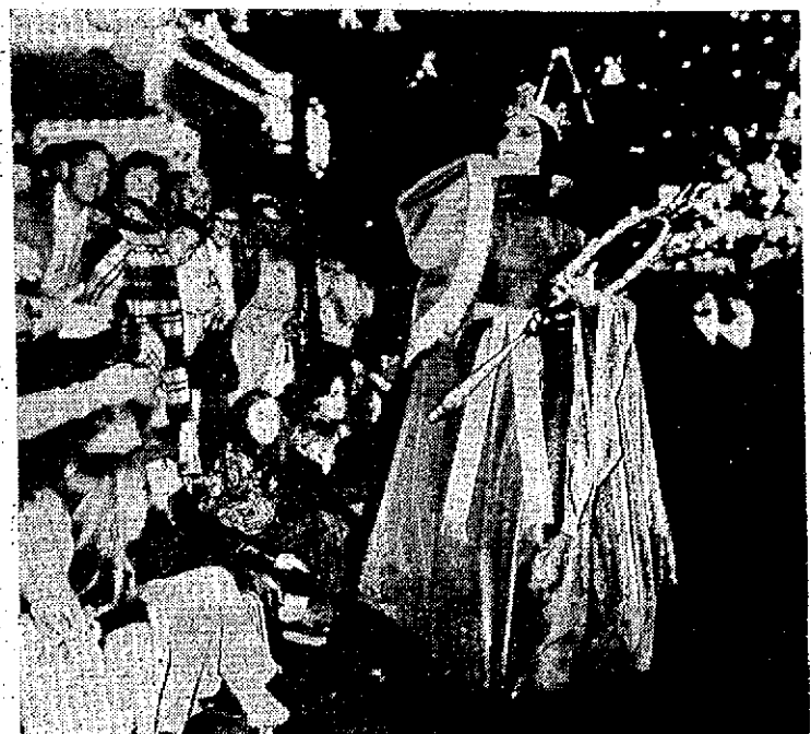
The vain Queen from the famous tale, "Snow White," is just one of more than 500 bewitching participants in Disneyland's "Fantasy on Parade."